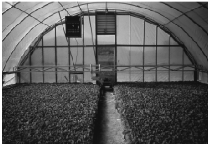
A greenhouse provides a protected environment for growing tobacco transplants, but careful management is required to achieve consistent results.

Note the difference in volume between the 338 and 338D trays; the 338D is a deeper tray. In general, as the cell volume decreases, so does the optimum finished plant size. The choice of tray comes down to maximizing the number of plants produced per unit area, while still producing healthy plants of sufficient size for easy handling. Smaller plants are not a problem for growers using carousel setters, but those with finger-type setters have difficulty setting smaller plants deep enough.