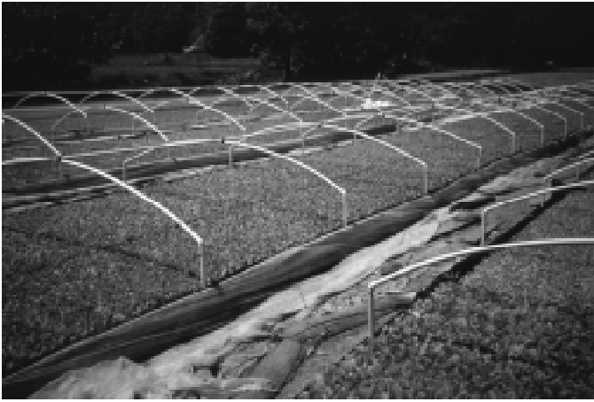
Outside float beds offer an economical alternative to greenhouses; however, there is a much greater risk of plant loss due to extreme weather conditions.